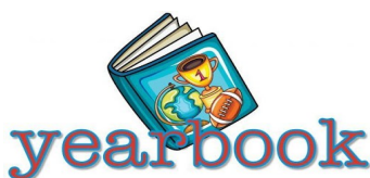
Photo albums are active in TreeRing! Please take a moment to upload the photos you have already taken. Doing it a little at a time means you can get the custom pages done early and the Yearbook Staff can get working on an excellent yearbook. If you haven't already downloaded the app on your phone, give it a try, it makes uploading photos even easier.

Our open house/school science is coming up in February. Open house/Science Fair Day is a required minimum day of school and attendance will be taken. More details to come in the coming weeks.