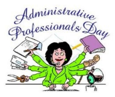
Administrative Assistant Appreciation Day is Wednesday, April 24.

Come check out your child's art work at the Chico Market Place from April 12 - May 6, by JCPenney and Planet Fitness!